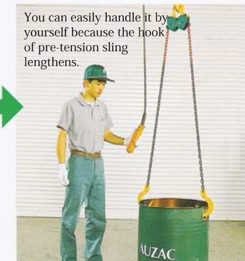
You can easily handle it by yourself because the hook of pre-tension sling lengthens.

■Specification of product Specification load●10kg~2.5ton Breaking force●12.5ton Stroke●180mm Product load●About 7.5kg