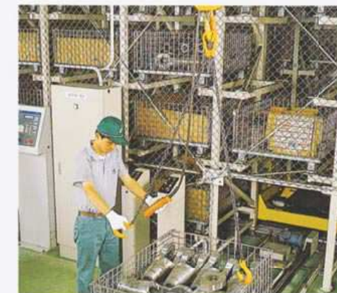
In the case of conventional products when one was set, the other was not set.

Just pull it and set it. Suspended loads are hold by the simple method safely and reliably.