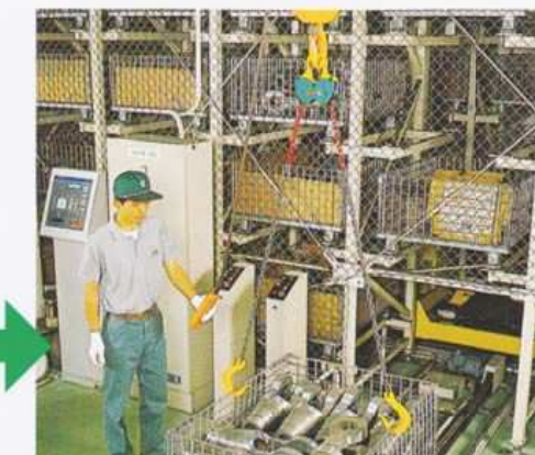
You can easily and firmly set this pre-tension sling with one hand.